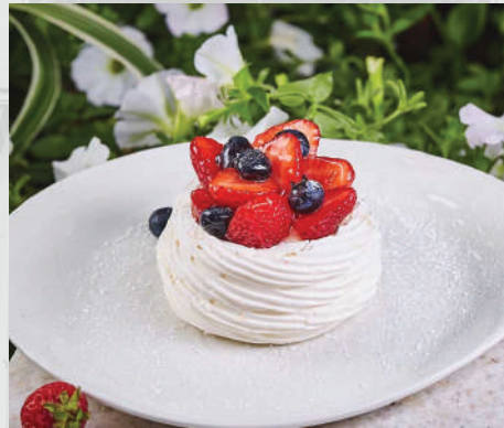
Restaurants and Gastronomy